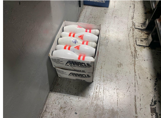
Retired bowling pins sit packed in a box behind the lanes. This shot highlights the old equipment being phased out.