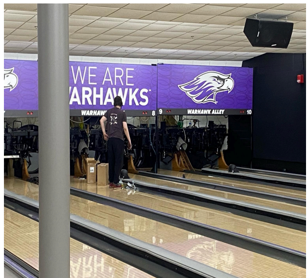
Ladders and disassembled pinsetting equipment fill the lane area as installation continues inside Warhawk Alley.