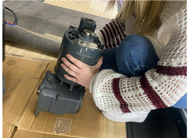
A worker handles a removed motor. Over the shoulder.