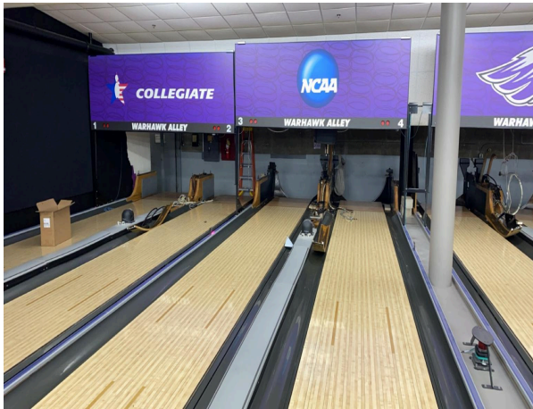
The pinsetterless lanes await the new arrival of the string machines.