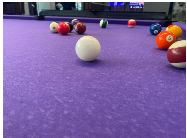
Since the alley will be closed for quite some time, pool is the new hot item at Warhawk Alley during the bowling alley's absence.