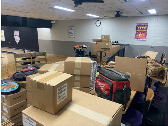
Boxes of equipment fill student seating areas as Warhawk Alley prepares for new string machines.