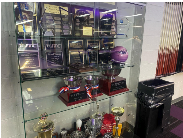
The bowling alley trophy case filled with accolades done by practicing on the older lanes. The bowlers seem to have a negative feeling about the new string machines.