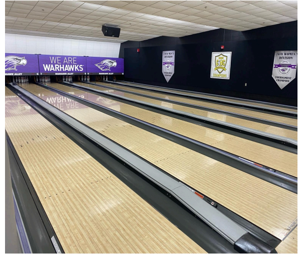
Drilled finger holes and scuffed surfaces show the wear of years of student play.