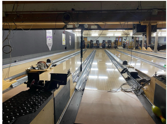
Warhawk Alley lanes sit completely shut down as pinsetters are removed across the entire center.