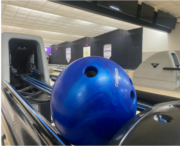
A bowling ball rests on the return system as the lanes behind it await installation.